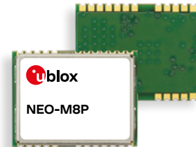
12.2 × 16.0 × 2.4 mm